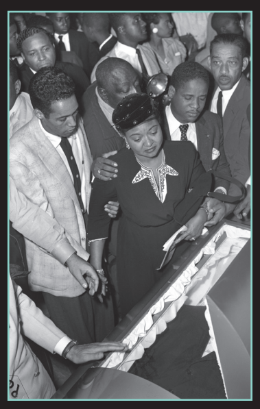
Photo: Chicago History Museum, ST-17500641-E1, Chicago Sun-Times Collection