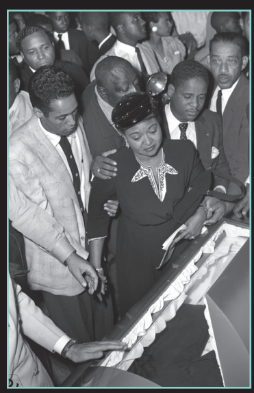
Photo: Chicago History Museum, ST-17500641-E1, Chicago Sun-Times Collection